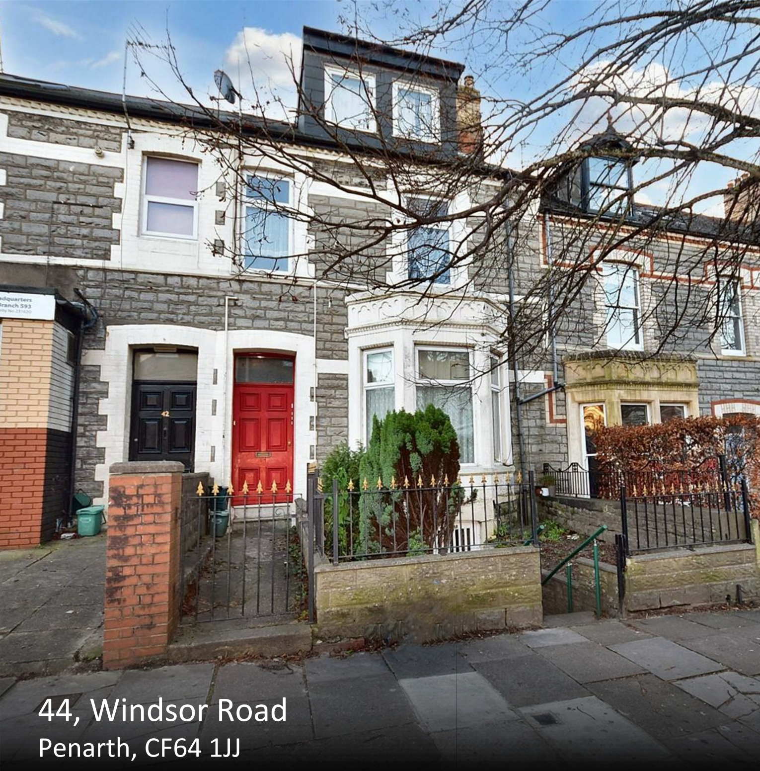
44, Windsor Road Penarth, CF64 1JJ